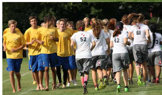
Swedish guys checking out Austrian girls