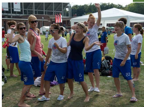
U17 Open, Initial Pool